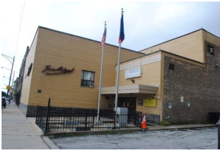
Fig. 1: Rizal Heritage Center