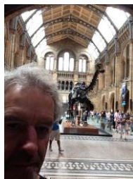
Fig. 16: Sir Les in London