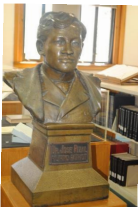
Fig. 6: Rizal Bust (NL)