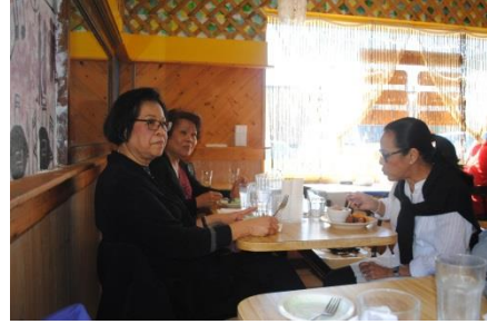
Fig. 9: Lunch, Little Quiapo