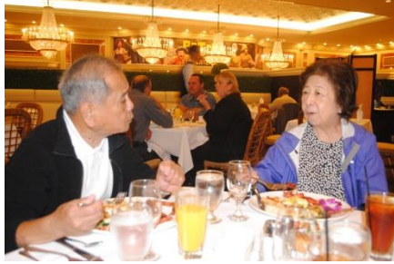
Fig. 8: Brunch at Drury Inn