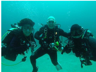
Fig. 12: Scuba Diving