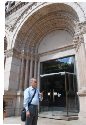
Fig. 5: Newberry Library