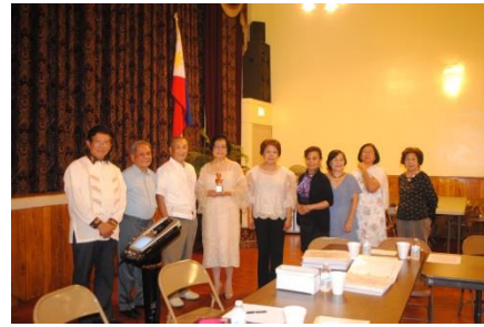
Fig. 2: Group picture, Chicago