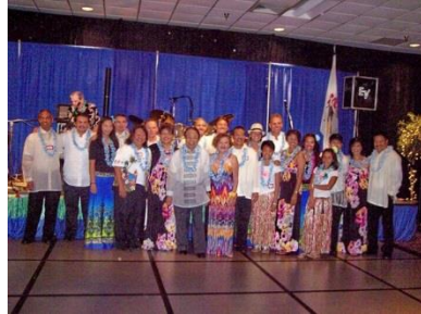
Fig. 11: Tejada's Party