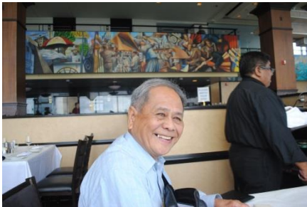
Fig. 3: Signature Room