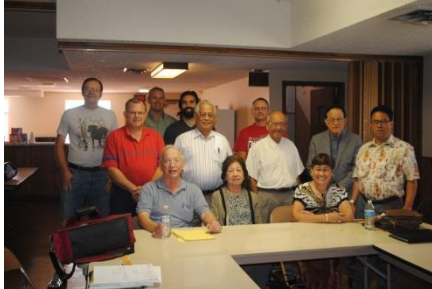
Fig. 10: Mokor Meeting