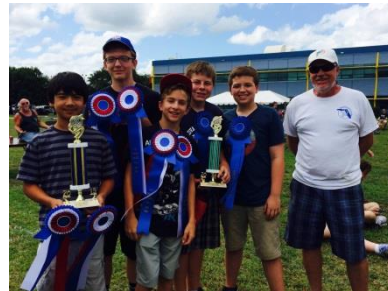
Fig. 13: Tek-wan-do Awards