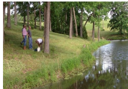
Fig. 15: Sir Stephen's Farm/Lake