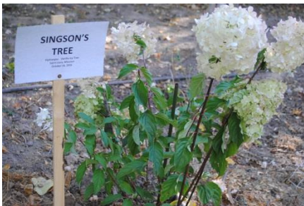
Fig. 13: Singson's Tree