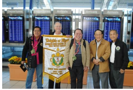
Fig. 2: Reception Committee