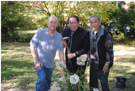
Fig. 11: The Planting Trio