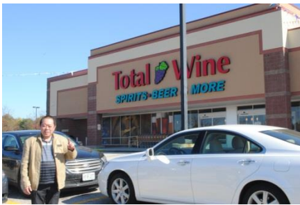
Fig. 3: Total Wine Store