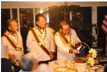
Fig. 7: Fraternal Message