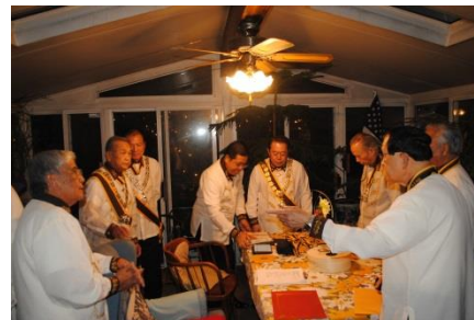
Fig. 6: Williamsburg Florida Room