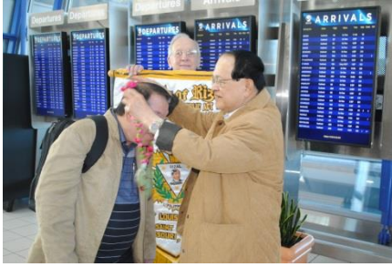
Fig. 1: Arrival, Lambert's Airport