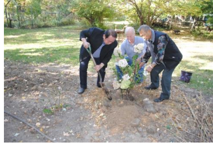
Fig. 10: Planting Tree