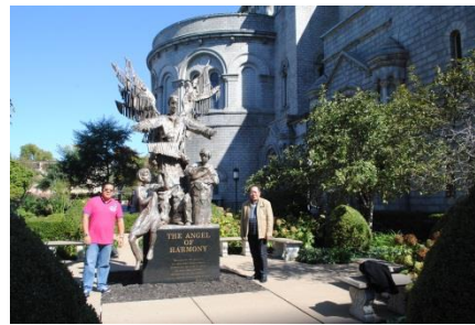
Fig. 4: St. Louis Cathedral