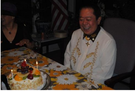
Fig. 9: Birthday Cake