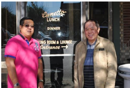
Fig. 5: Cunetto's Restaurant