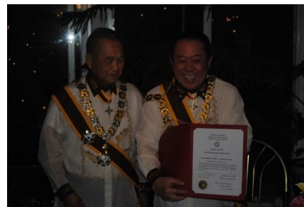
Fig. 8: Moker's Award