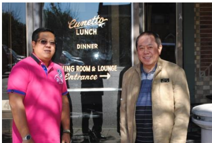
Fig. 5: Cunetto's Restaurant