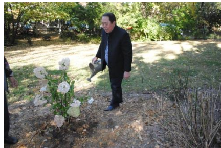
Fig. 12: Watering